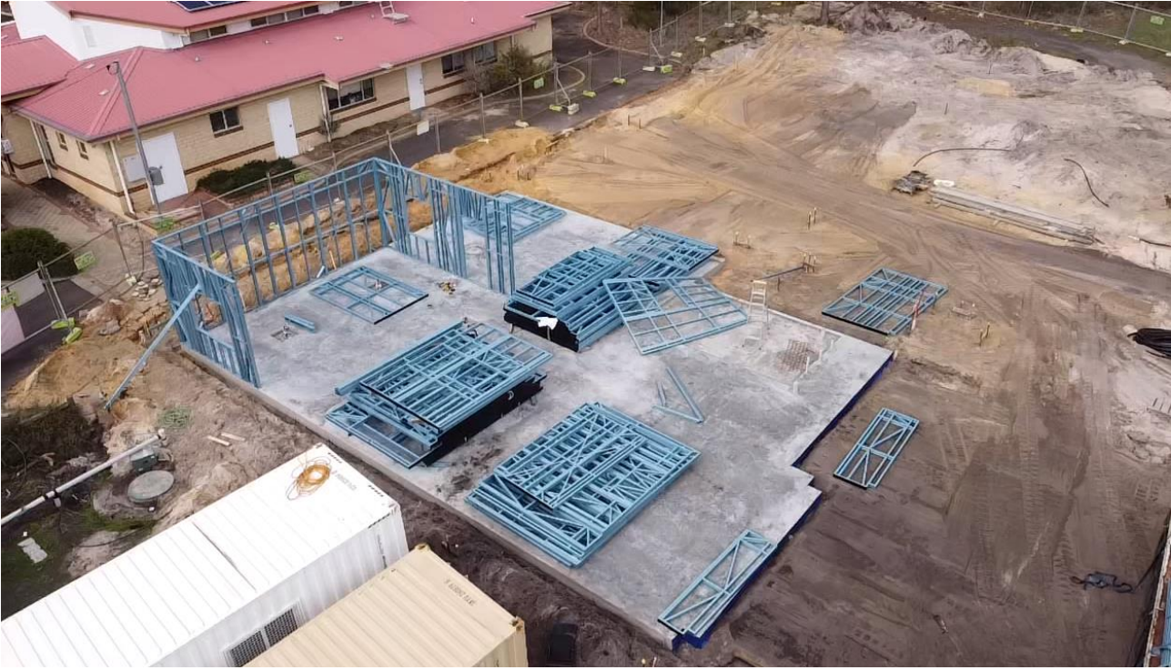
Progress Images: (Images taken 3 July 2023)